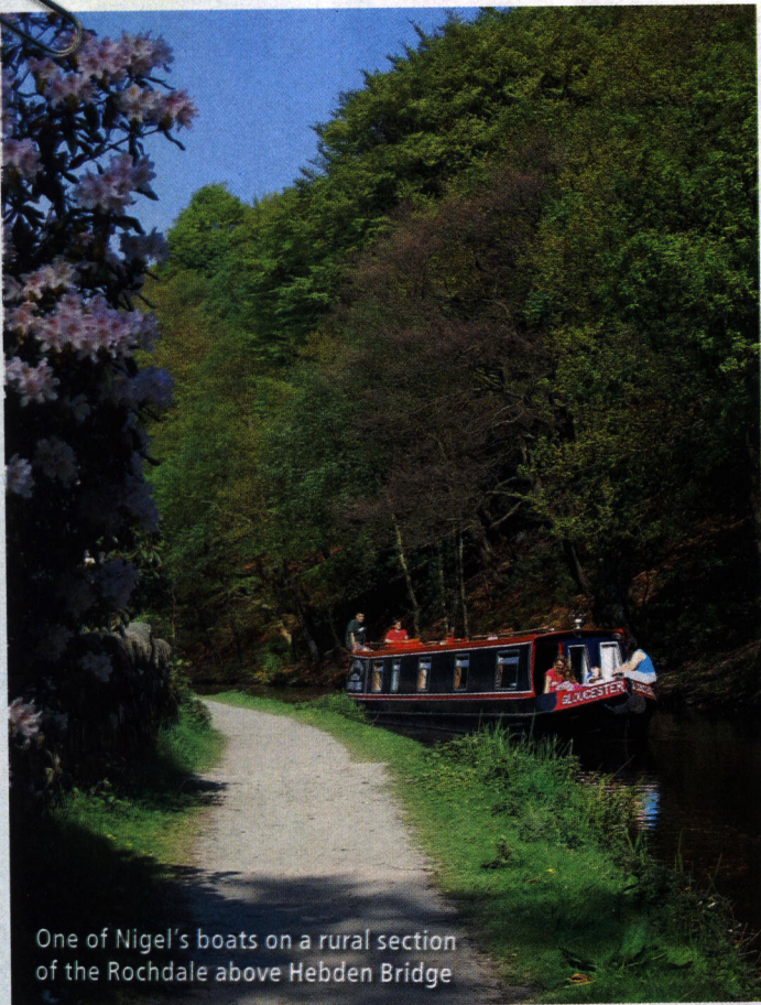
One of Nigel's boats on a rural section of the Rochdale above Hebden Bridge